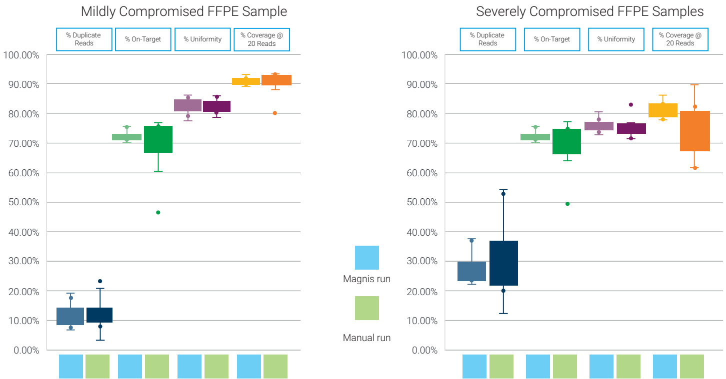
Figure 3. Quality of libraries generated by Magnis compared with those by manual prep. 10 ng of gDNA was extracted from both mildly and severely compromised FFPE samples, mechanically sheared, and used in each of the five Magnis runs with a 118 kb custom NGS panel. Sequencing metrics were compared head to head between these two methods for each of the four categories.

Like the reagents and instrument, the Magnis protocols are developed and optimized for the industry-leading SureSelect library preparation and target enrichment technology. The first protocol released on the Magnis system, SureSelectXT HS-Illumina, is supported by SureSelect XT HS chemistry and has been extensively tested and validated with different biological sample types. Figure 3 illustrates that the Magnis performance is both reproducible and comparable to a manual workflow performed by an experienced NGS technician. With more Agilent-validated protocols becoming available in the near future, Magnis users will be able to quickly expand their applications by downloading new protocols directly to the instrument.